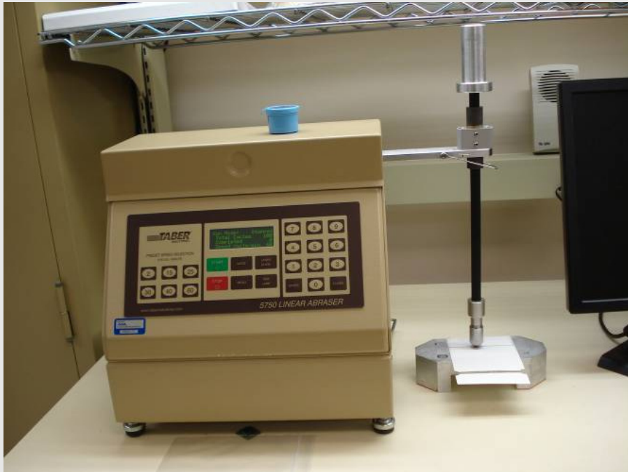
MODEL : Linear Abraser 5750